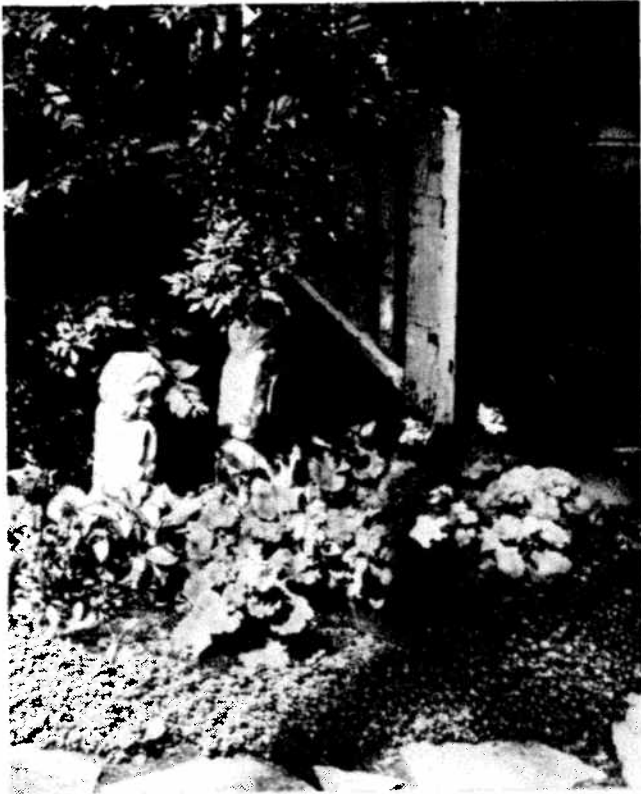
Gardens such as this one at 1802 North Lincoln Park West are proudly displayed during the annual Old Town Art Fair.